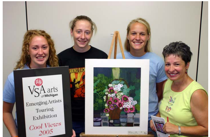
Volunteers setting up the VSA arts of Michigan gallery pause to show off one of the many pieces on display.