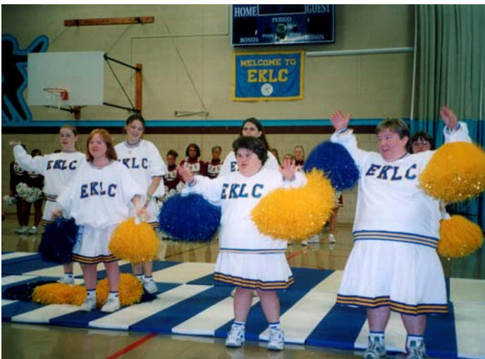
The Elmer A. Knopf Learning Center Varsity Cheerleaders perform at the Annual Cheerleading Festival in September.