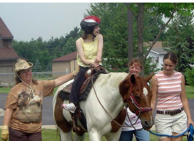
A student at Marion D. Crouse Instructional Center enjoys her horse riding experience.