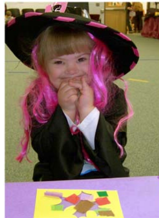
A costumed ECPS student enjoys an activities at the Fall Harvest Festival.

On Friday, October 24, 2008, Early Childhood Programs and Services (ECPS) held its annual Fall Harvest Festival. Making goodie bags and sun catchers, decorating picture frames, playing in a jump house, ghost bowling, decorating cookies, and face painting are just some of the activities enjoyed by ECPS students and their families. At the festival, photos were taken of the kids and