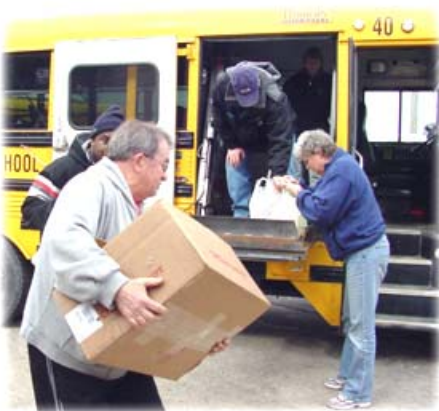
Pictured are GISD Transportation Services employees unloading the bus filled with food that was donated to the Salvation Army.

Recently, GISD Transportation Services conducted its first annual food drive that was very successful. When representatives arrived by bus to deliver the collected food at the Salvation Army facility, they saw empty shelves where food should have been. After the buses were unloaded, the shelves, although not completely full,