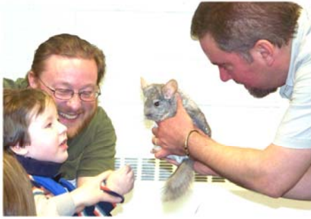
An ECPS student comes face-to-face with a Chinchilla.

Python, a Blue Tongue Skink, and a Chinchilla. The children were also able to see a Honduran Milk Snake, a Giant African Bullfrog, a Bird-Eating Tarantula, a Green Iguana, a Snapping Turtle, an American Alligator, and an