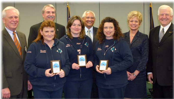
Pictured are GISD Board of Education members with the GISD Transportation Services staff that participated in the National Special Needs Team Safety Rodeo.

On February 28, 2009, both teams competed at the 12th Annual National Special Needs Team Safety Rodeo in Indianapolis, Indiana. This national event represents the best of the best in special needs bus teams. The competitions tested their skills in student management, wheelchair loading and securement, and proper placement and securement of car seats. The teams also demonstrated proper pre-trip inspections, managing a real-life emergency event, and maneuvering through a driving course replicating unique situations that may be encountered when driving a bus with students aboard.